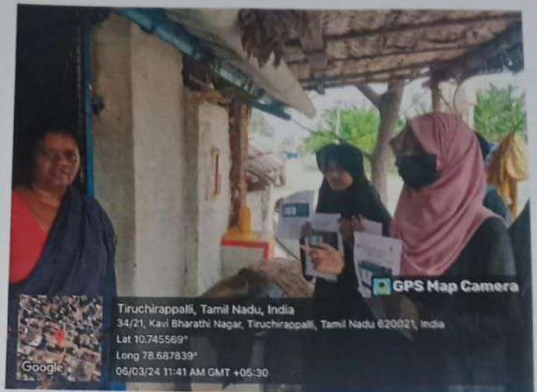
YRC volunteers explaining about cancer symptoms and prevention